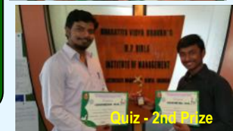
Quiz - 2nd Prize