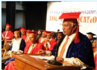
Chairman addresses Convocation '15