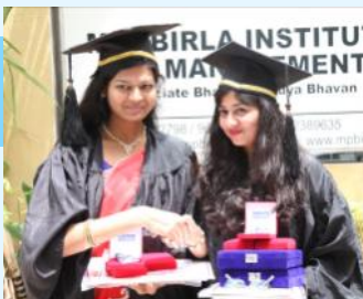
Top Medal winners