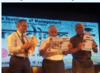
Release of April Newsletter during Paradigm 2015