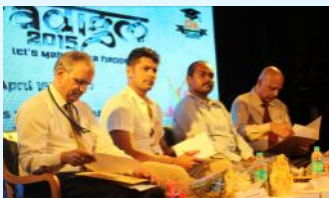
Inauguration of Paradigm 2015