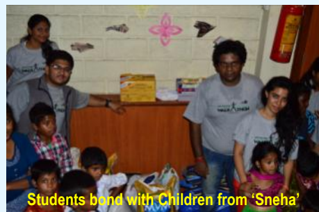
Students bund with Children from 'Sneha'