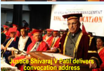
Justice Shivaraj V Patil delivers convocation address