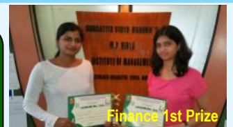
Finance 1st Prize

MPBIM students proved their mettle at the management fest conducted by Post Graduate Department of management studies, Siddaganga Institute of Management, Tumkur where they bagged all the major awards and won team championship.