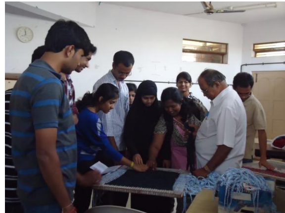
Vocational Training Centre where mats, candles, plates are manufactured