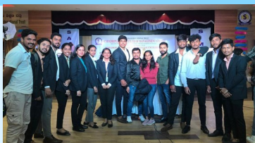
MPBIM Students at AAKRITI Management Fest held at Sheshadripuram Institute of Management Studies