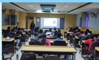
Digital Marketing Session