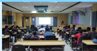
Product Management Session