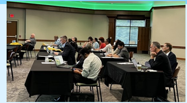
View of Conference at NDSU