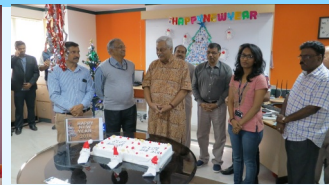
New Year welcomed at MPBIM