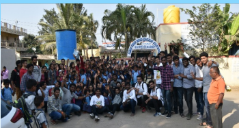
MPBIM Student Executives with Children at the Govt. School, Kuduregere