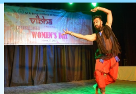
Dance performance by Student Executives during Women's Day at MPBIM