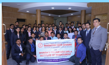
Students from BIMSOL, Kolkata at BPBIM for an exchange programme during February 2019