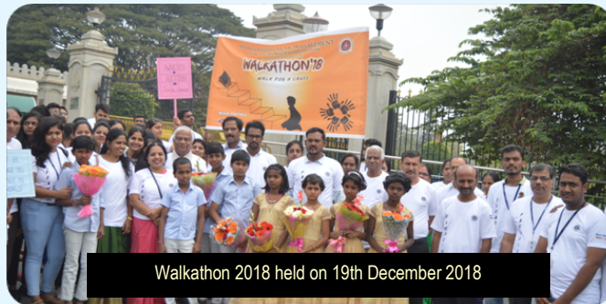
Walkathon 2018 held on 19th December 2018