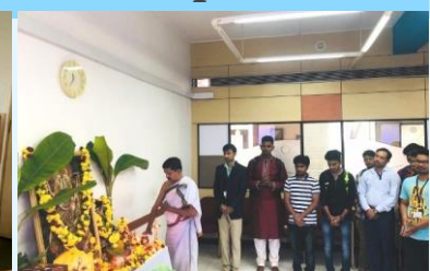
Saraswathi Pooje at MPBIM during Dasara festival