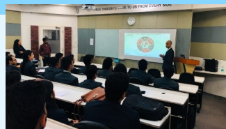
Societe Generale makes a pre-placement presentation at MPBIM