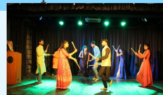
Annual Dandiya at MPBIM held during Dasara Festival