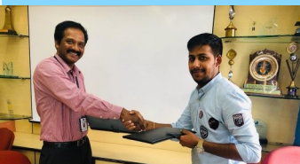
MPBIM & BrandXpress sign MOU for student progression